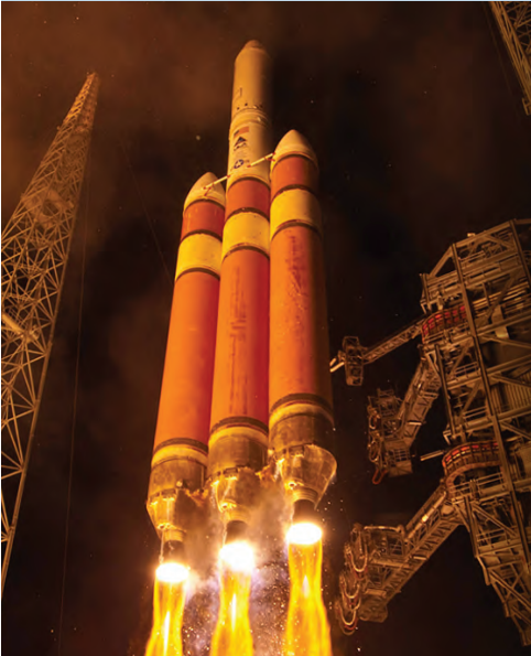
Delta IV The RL10B-2 powers the United Launch Alliance Delta IV's second stage with 24,750 lbs of thrust. This engine boasts a precision control system and restart capability to accurately place payloads into orbit.