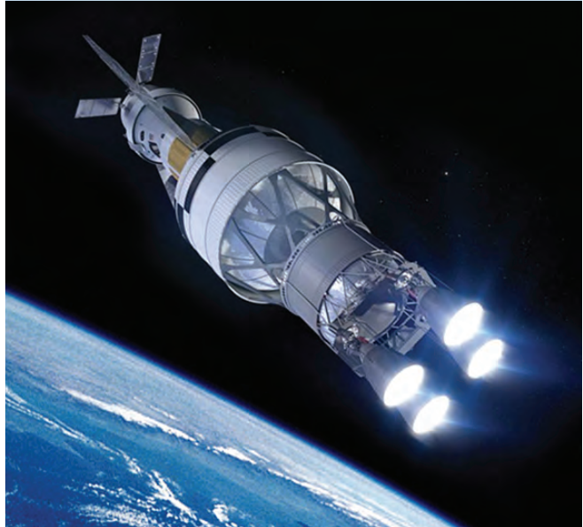
SLS Exploration Upper Stage One RL10B-2 engine will help power the inaugural flight of NASA's Space Launch System, Exploration Mission-1. Future flights will incorporate four RL10C-3 engines on the SLS launch vehicle's Exploration Upper Stage.