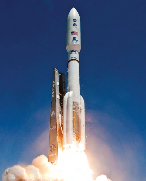
Atlas V Depending on mission requirements, the United Launch Alliance Atlas V's Centaur upper stage is powered by a single RL10C-1 engine or two RL10A-4-2 engines.