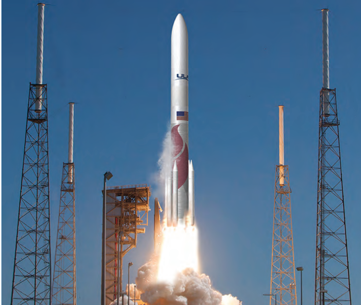
Vulcan Centaur RL10 rocket engines that incorporate 3-D printing and other advanced technologies will power the upper stage of the Vulcan Centaur launch vehicle that is currently being developed by United Launch Alliance.